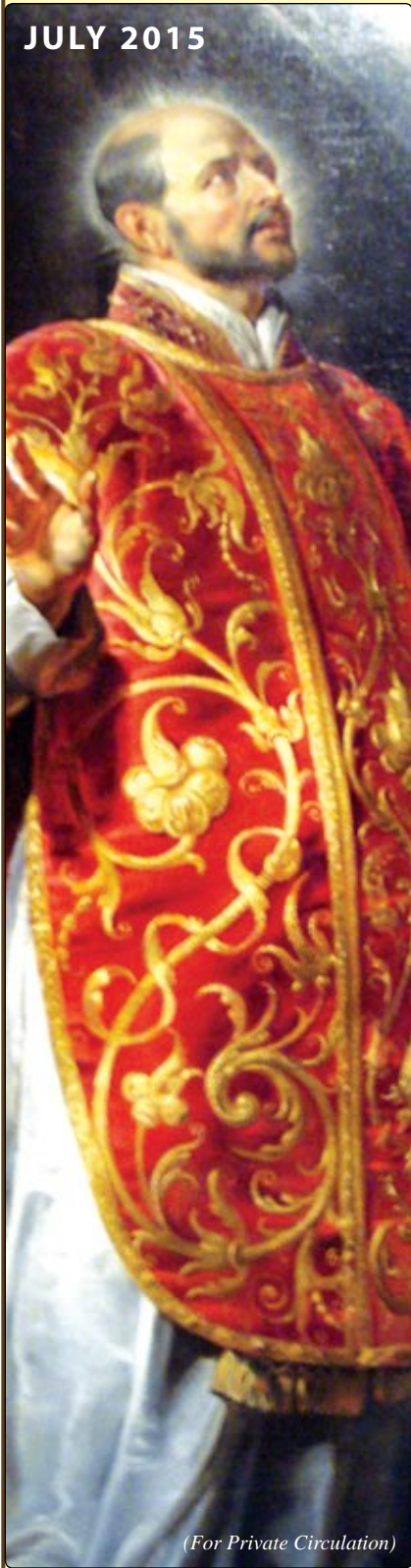
(For Private Circulation)