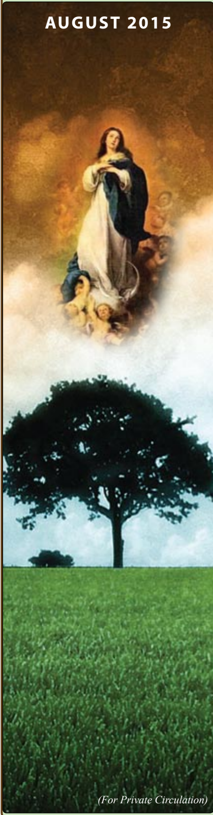
(For Private Circulation)